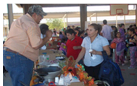
Students sample wares of local vegetable producers