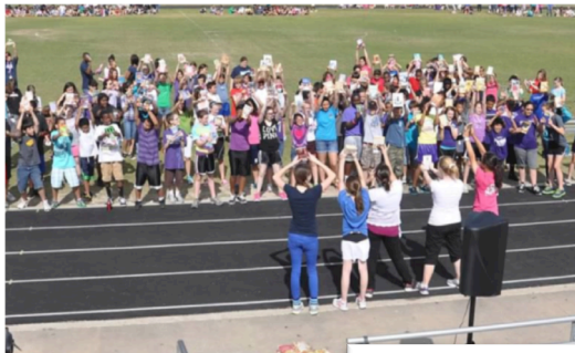
Community & school join in 5K run