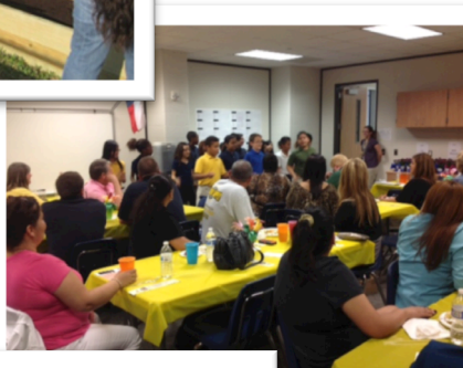
Students share nutrition knowledge with parents